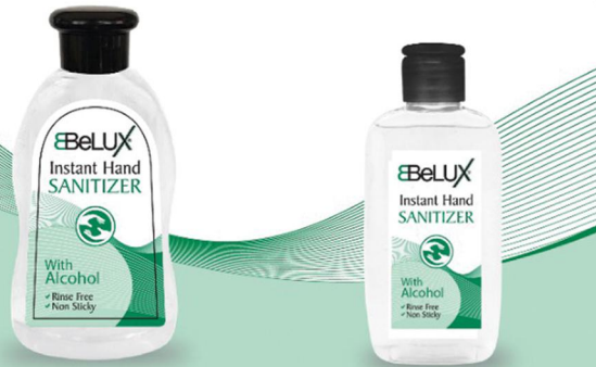
150 ml Belux Instant Hand Sanitizer

Product Code : 1357 Box Weight : 7,5 kg Box Dimensions : 330x225x185 mm Inner Amount : 24 PCS Palette :